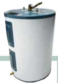
Retail Repair or Replacement Costs (without an HMS Home Warranty)

Plan for Peace of Mind An HMS Home Warranty provides assurance that you won't have to worry when a covered appliance or system breaks down, and that you will be provided with a repair professional you can trust.